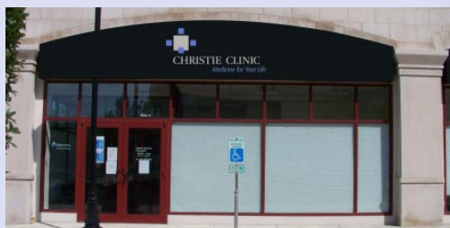
Christie Clinic on Gregory